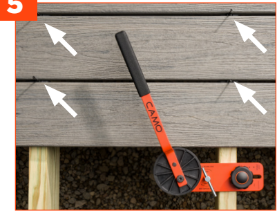
Leave LEVER in place until all clips are fastened.