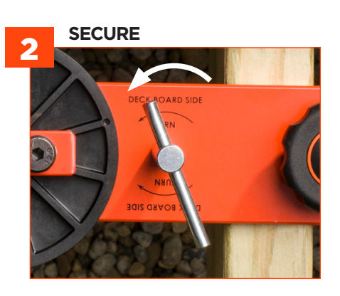
Tighten the joist cam with the Pivot Pin.