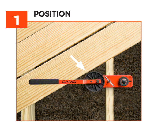
Place LEVER with the board cam on the low section of the decking.