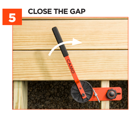
Keep turning until the board is in desired fastening position.