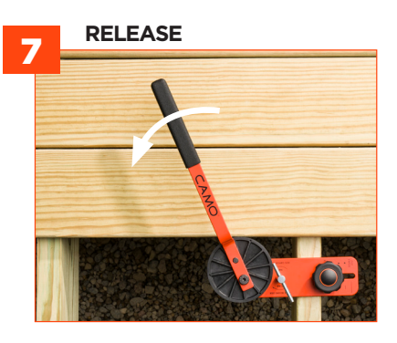
Release pressure by moving the handle away from the deck board.