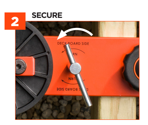
Tighten the joist cam with the Pivot Pin.