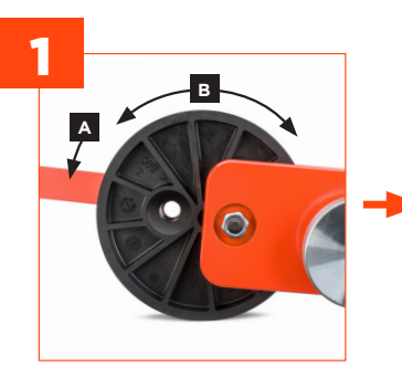
A - Straighten the handle.

B - Align both holes by rotating the board cam.