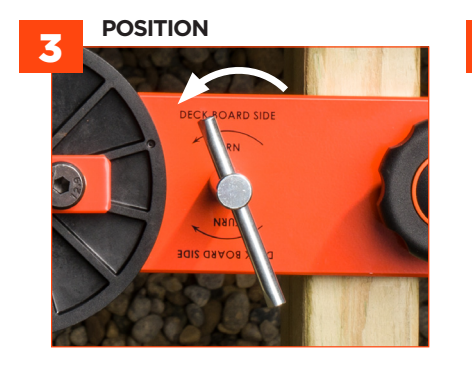
Place LEVER on the joist and tighten the joist cam with the Pivot Pin.

Adjust the stop block to the proper joist width and tighten the knob.