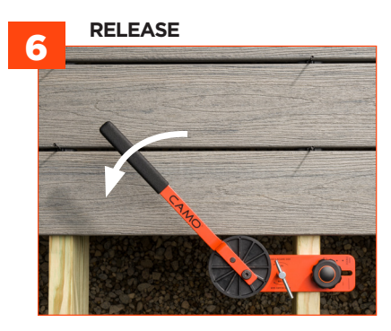
Release pressure by moving the handle away from the deck board.