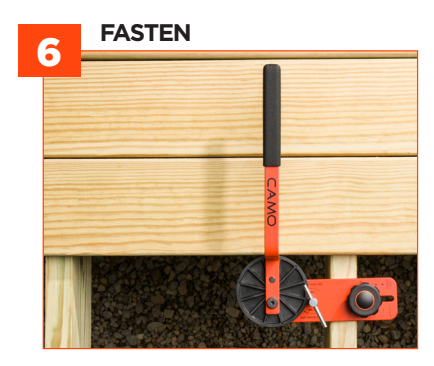
Leave LEVER in place until all fastening is complete.