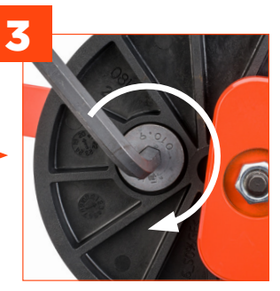
Use supplied hex key to securely tighten the screw.