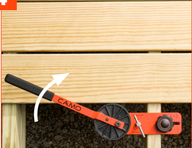
Apply pressure by moving the handle towards the deck board.