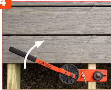
Apply pressure by moving the handle towards the deck board. Do not over-tighten as the boards can buckle.