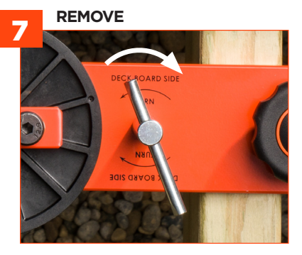
Loosen the joist cam and remove LEVER.