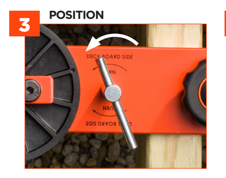
Place LEVER on the joist and tighten the joist cam with the Pivot Pin.

Adjust the stop block to the proper joist width and tighten the knob.