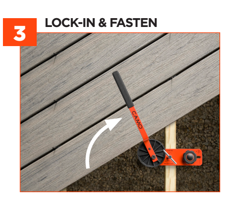
Apply pressure by moving the handle towards the deck board. Do not over-tighten as the boards can buckle.

Leave LEVER in place until all clips are fastened.