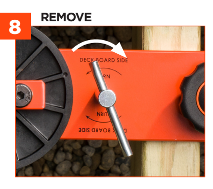
Loosen the joist cam and remove LEVER.

800-968-6245 • INFO@CAMOFASTENERS.COM • WWW.CAMOFASTENERS.COM D C f D O