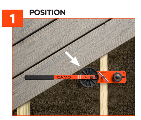
Place LEVER with the board cam on the low section of the decking.